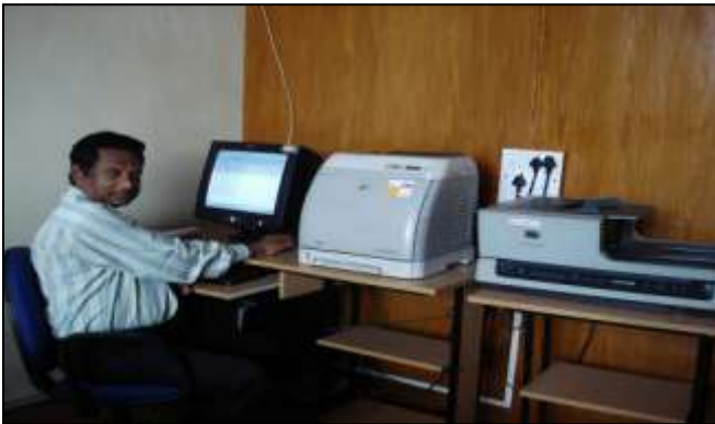
LIBRARIAN AT E-HERBERIUM DATABASE COMPILATION