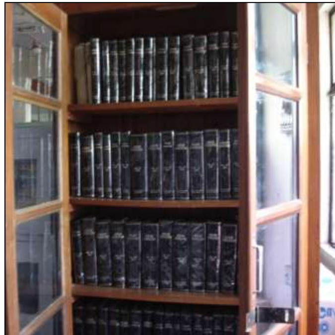
CONFESVATOR OF FOREST AND SILVICULTURIST (W.R.) PUNE

LIBRARIAN M.S.PUNE INDIAN FORESTER 1976-2009